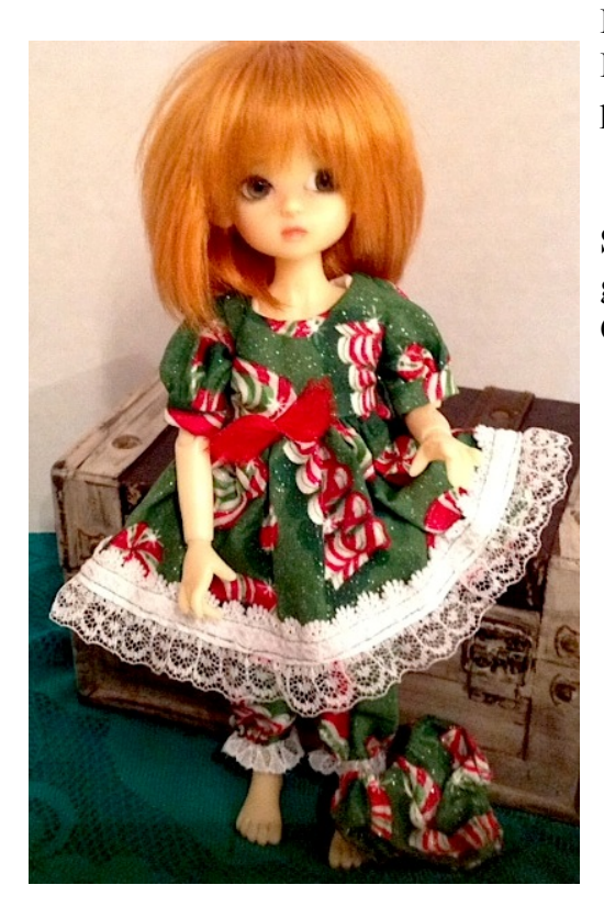
#45 Seasons for MSD http://www.gracefaerie.com/patterns/pattern45.html

Print the Planet Doll size pattern pieces at 65%.